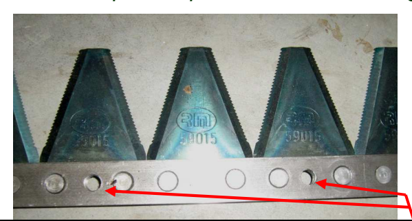
Figure 4A: "Bolt-on" type blade; note that there is no "serrated plate" on the blade to attach the blade coupling to...instead, the bolt-holes are drilled directly in the "strip.

The blade sections on this type of blade were also installed differently: instead of rivets being installed from the bottom and hammering on the top of the rivets, these were designed to have the rivets go down from the top and be hammered on the bottom-side. (Any excess rivet head material that won't fit into the "countersunk" hole in the bottom of the blades needs to be removed with a grinder so the blade will lay flat on the lower stationary blades.) These blades can be identified by the large hole between the rivet placement holes and the stamping 59015 . BCS abandoned the "Bolt-on" coupling system by 1997. (If you have this style blade and want to change over to the newer type (figure 3) blade type with it's stronger blade coupling type, this is possible, but multiple components must be changed; ask Earth Tools for a quote.)