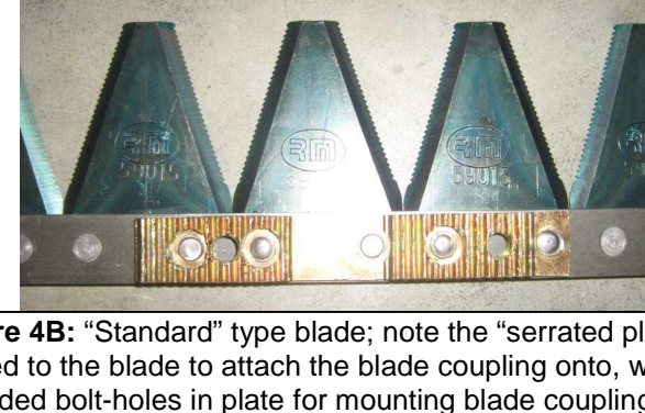
Figure 4B: "Standard" type blade; note the "serrated plate" riveted to the blade to attach the blade coupling onto, with threaded bolt-holes in plate for mounting blade coupling.