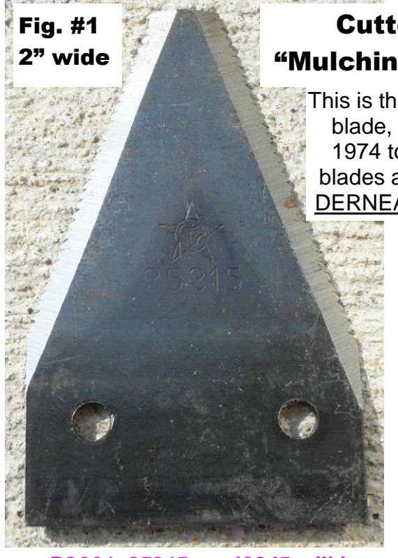
D2001, 85315, or 48945 will be stamped into this blade.

In order to ensure that you order the correct replacement cutter bar blade sections (individual teeth) OR complete blade assemblies, the following figures will allow you to match up the original blade to the proper part numbers. PLEASE READ THOROUGHLY!!!