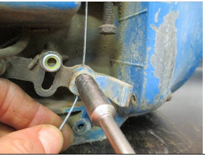
#2. LOOSEN THROTTLE CABLE CLAMP ON ACME ENGINE (MAY HAVE TO HOLD BOTTOM PART OF CABLE WITH A PLIERS) (Acme gas engine pictured)