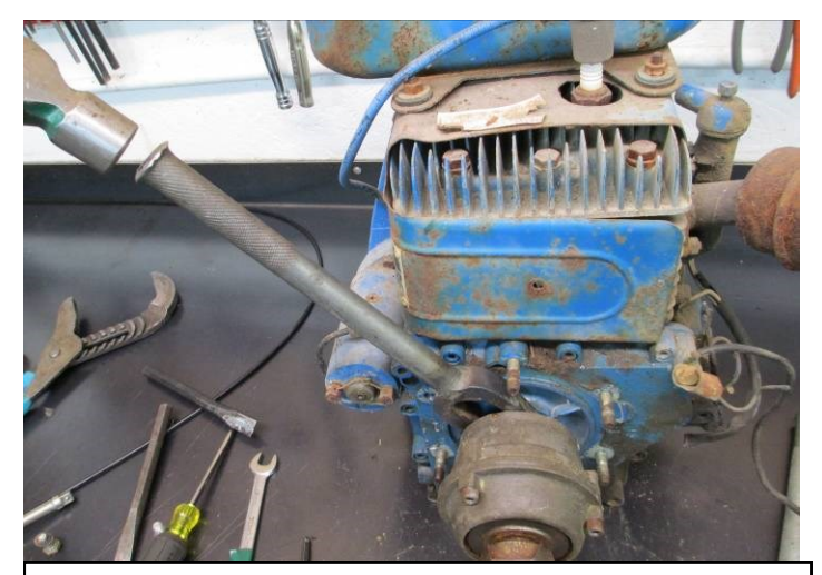
#8A. ANOTHER OPTION, IF YOU HAVE ACCESS TO ONE, IS A LARGE BALL-JOINT SEPERATOR FOR AUTOMOTIVE USE. THIS IS LIKE A BIG TAPERED FORK, AND CAN BE DRIVEN IN JUST LIKE THE CHISELS (BUT BEING ONE PIECE, IT IS EASIER TO USE)