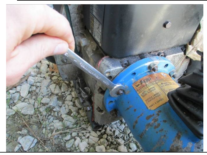
#1. USING 13MM WRENCH, REMOVE NUTS AND WASHERS SECURING ACME ENGINE TO TRANSMISSION. (On SEP/Mainline machines, these are BOLTS instead)