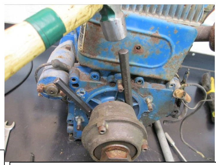
#8. ...AND THEN THE OTHER, EVENLY, UNTIL THE CLUTCH POPS OFF THE TAPER. (THE BOLT INSIDE THE CLUTCH IS "TRAPPED" INSIDE, IT WILL NOT COME OUT)