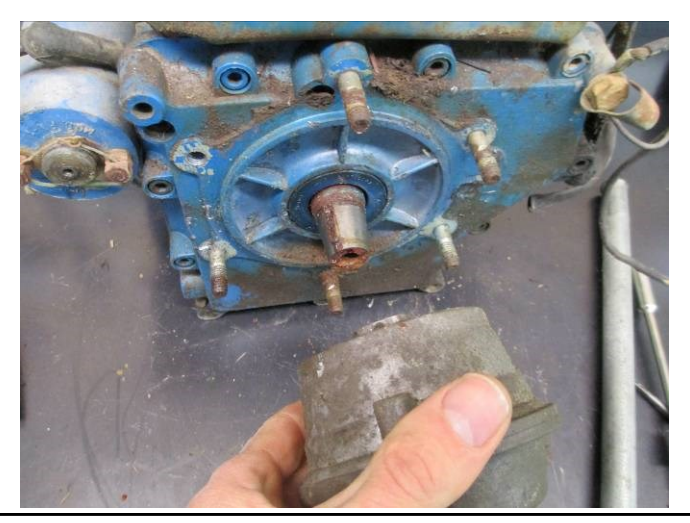
#9. REMOVE CLUTCH FROM CRANKSHAFT.

CLUTCH CAN NOW BE SERVICED, "BROKEN LOOSE" (IF IT IS "STUCK"), OR REPLACED, AS NEEDED.