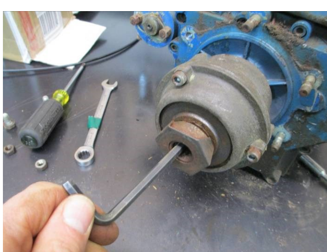
#5. INSTERT A 6MM ALLEN WRENCH INTO THE HOLE IN THE CLUTCH; FEEL AROUND FOR THE BOLT-HEAD. (NOTE: On SEP/Mainline units, remove center bearing assy. from clutch [just slides out] and use a 13mm socket to remove center bolt)

#4. REMOVE ENGINE FROM TRANSMISSION (MAY HAVE TO WIGGLE A BIT TO GET LOOSE) CONE CLUTCH ASSY. (PICTURED) COMES OFF WITH ENGINE (NOTE: SOME BCS TRACTORS HAVE A DISK CLUTCH...IN THIS CASE THE CLUTCH CARRIER COMES OFF WITH THE ENGINE. IF YOU HAVE TROUBLE GETTING THE CARRIER OFF THE ENGINE, CALL US FOR INSTRUCTIONS AT 502-484-3988.)