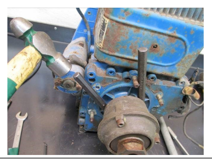
#7. NOW THAT THE BOLT IS LOOSE, THE CLUTCH MUST BE BROKEN FREE FROM THE TAPER-LOCK ON THE CRANKSHAFT. THIS CAN BE DONE BY WEDGING TWO LARGE COLD-CHISELS (METAL-CUTTING CHISELS) BETWEEN THE CLUTCH HOUSING AND THE ENGINE CRANK-CASE—ONE ON EITHER SIDE OF THE CRANKSHAFT—AND HITTING ONE...