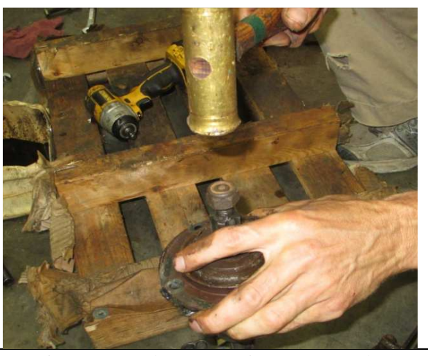
7. The shaft can be driven out of the cover with a brass hammer, while holding the cover, or positioning the cover over an open vise, etc. to support it. Again, BE SURE TO HAVE A NUT ON THE THREADS!