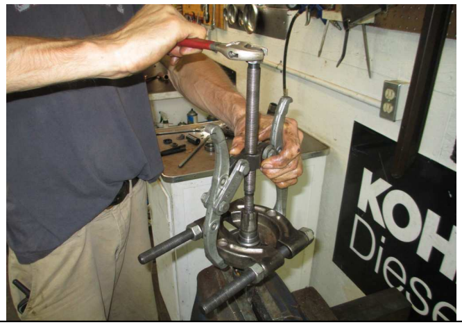
10. If the bearing (8 & 9) did come apart, the <u>inner</u> race remains on the shaft. It can be removed using the tools pictured, or by carefully grinding through the inner race on one side, so it will "open up" and fall off the shaft easily. (BE CAREFUL not to damage the seal-surface of the shaft, or the shaft is ruined!) NOTE: a good machine-shop can get these races out too...