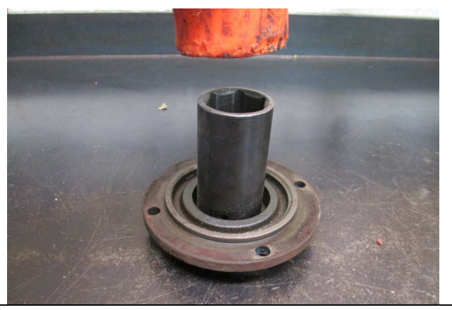
18. Oil the outer edge of new seal first, then, with the flat side of the socket against the seal, use a hammer to tap seal evenly into place.