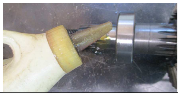
21. Apply some oil to the side shaft prior to inserting through the new seals, and be careful for sharp edges on the shaft that might cut the seal.