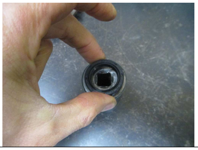
17. Installing new seals: This is an odd seal installation...typically, when installing a seal, you driving on the OUTSIDE of the seal... but because of the way this gearbox is built, you are actually driving on the INSIDE of the seal where it is "open", and you have to be much more conscious about not damaging it. We find that using the FLAT BACKSIDE of a large socket (larger than the seal) works very well.