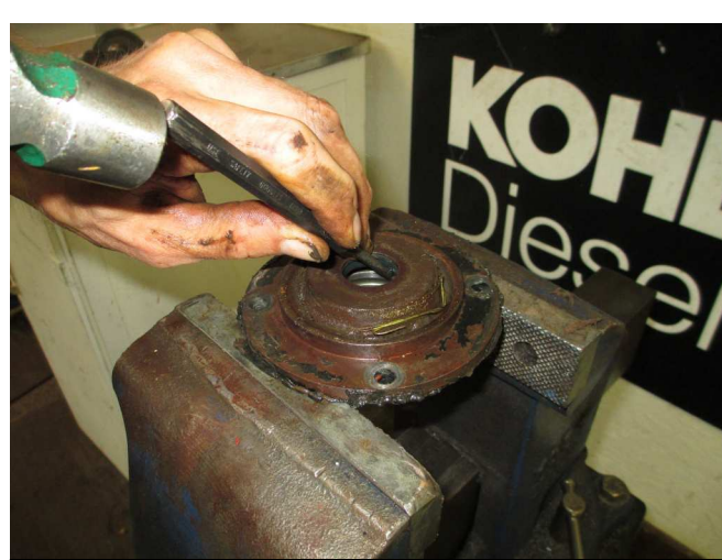
9. Once it is far enough out, the race can be hit from the other side with a punch to get it the rest of the way out. (switch side-to-side, so it comes out relatively straight)