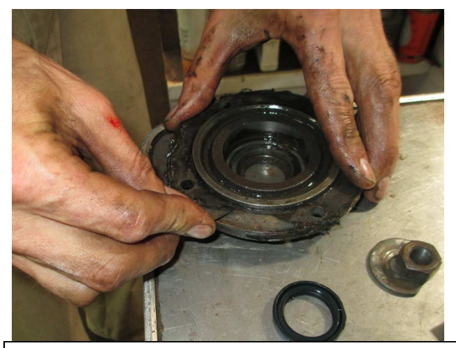
15. Before re-assembling, thoroughly scrape all gasket surfaces. A razor blade works well for this.