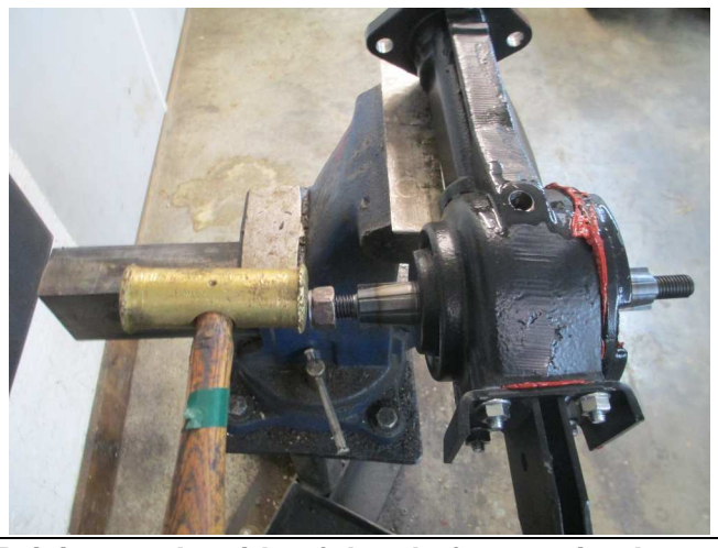
5. Driving on the side of the shaft opposite the cover, use a brass hammer to knock out the shaft, which pushes off the gearbox cover. PUT A NUT ON THE SHAFT (even with end) TO PREVENT DAMAGE TO SHAFT THREADS!!