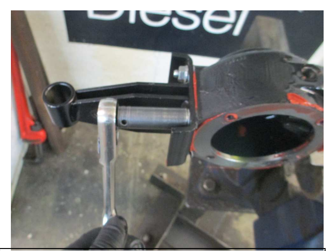
13. If input shaft needs service, remove the rear cover.