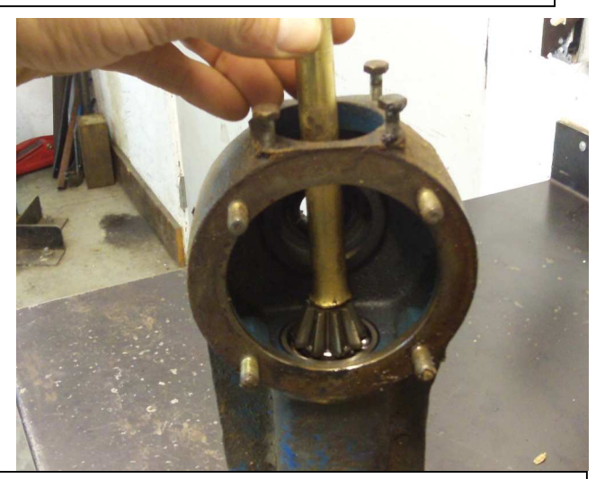
20. ...the pipe holds the bearing IN the front while you drive the shaft into place from the rear. When done, replace the front oil seal.