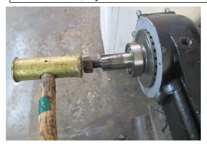
22. With the bearings installed on the shaft, drive the shaft back into place in the gearbox...note the nut on the shaft end again, to protect the threads. NOT A BAD IDEA to get a spare nut from us when you order your new seals, etc...so you can "beat up" just one old nut, and throw it away when done with repair!!