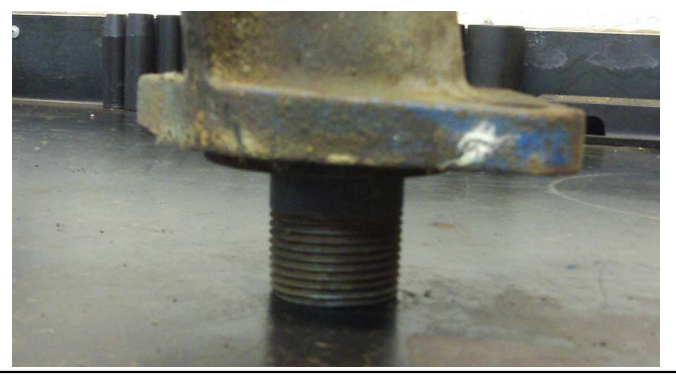
19. If you took the input shaft & bearings out, FIRST drive the front bearing back into the front of the gearbox. Then, install the rear bearing on the shaft. THEN, find a piece of pipe or a socket that has a diameter that will support the inner race of the front bearing, AND let the shaft project through it. Set the gearbox up on the pipe as shown...