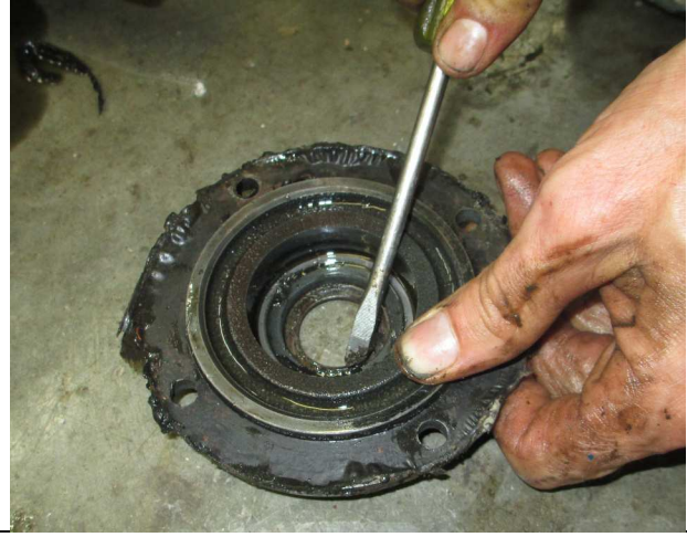
12. After seals are removed, thoroughly scrape behind where seal sat...there will be a lot of dirt packed in there.