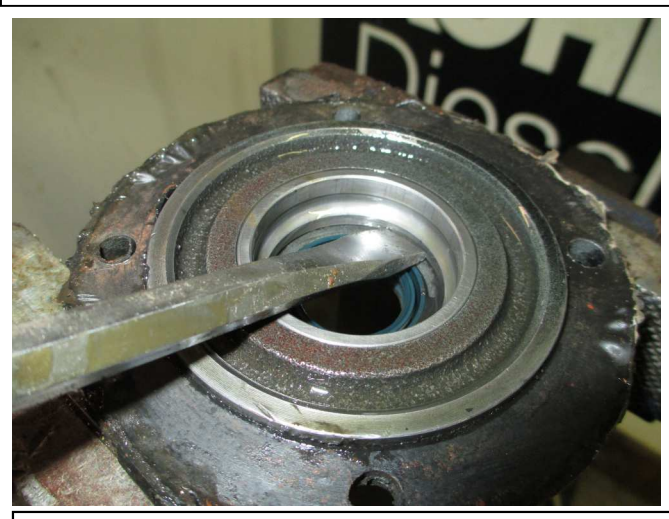
8. On older units, it is not uncommon for the cover-side bearing to come apart, leaving the outer race of the bearing in the cover. If this happens, it can be "walked out" with chisels (increasing size as it moves out...wedge under one side, then the other).