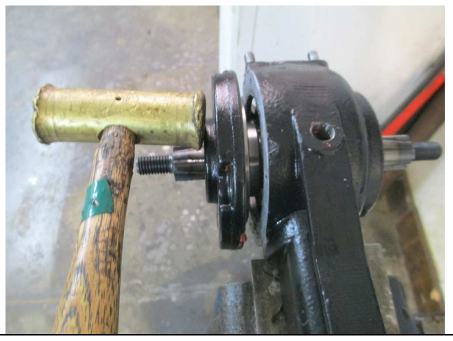
23. Making sure to apply some new silicone sealant. And as we mentioned earlier, you might need a gasket as well, for proper gear spacing, particularly if you changed the bearings or a gear/s. Install the side cover, tapping evenly all the way around so it goes on straight. Once it gets close to the gearbox, you can draw on EVENLY with the 4 fasteners.