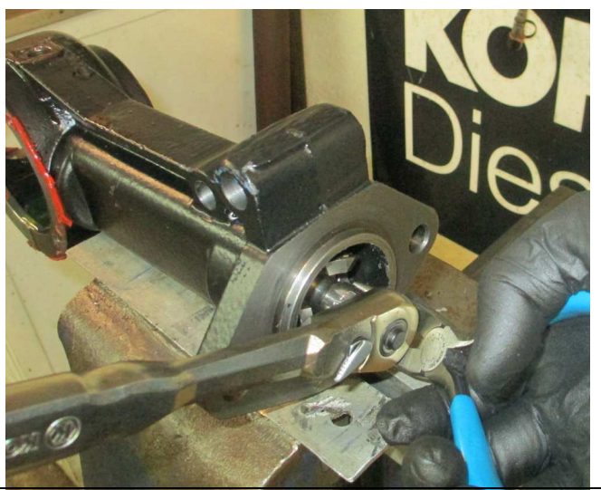
14. The shaft is held in either by a snap-ring on the front (Spline-drive models, pre-1994) OR by a bolt holding the 3-tooth coupler on. If the former, pry out the front seal with a screwdriver and remove the snap-ring with a snap-ring pliers. If the 3-tooth type, hold the coupler with a pliers while loosening the bolt, then remove the coupler. Then drive the shaft out with a long punch or rod.

16. If there is any foreign material in the gear-case (dirt, water, metal bits from broken gears or worn bearings, etc.), the gear-case must be thoroughly washed out before re-assembly, or the foreign material will ruin the gears and bearings. Best to wash with a parts washer, but you can improvise with a bucket and some kerosene or diesel fuel and a brush (an old toothbrush works well). Towel out the residue as best as you can, or blow out with an air compressor (may have to do both).