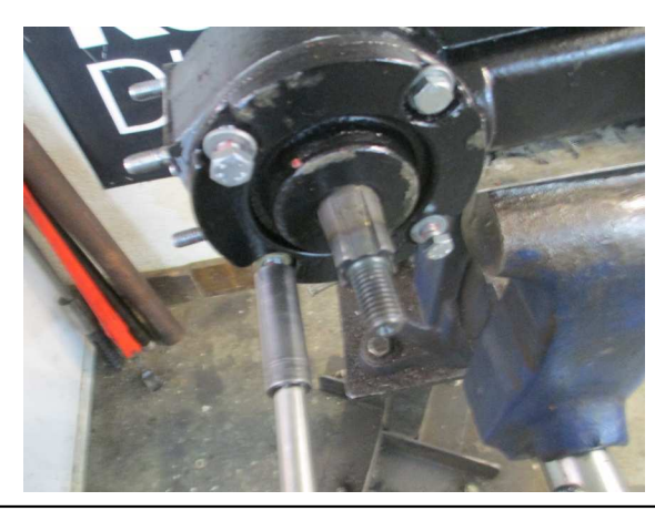
24. Tighten down fasteners. Should be about 18 ft.lbs. of torque.

25. This is critical: after the cover is tight, put your "beater nut" on the side of the shaft OPPOSITE the cover, and whack it a few times. This gets the two gears AS FAR APART as possible, so you can accurately check the clearance between the gears. To check this: rotate the input shaft by hand back & forth slightly...you SHOULD be able to feel just a tiny bit of movement in the input shaft WITHOUT the side shaft moving...this means there is SOME clearance between the gears. If there is NO "space", then the gears are too tight, and you will have to pop the cover back off (repeat step 5) and install one more gasket than you had in there (if you had one in there, it can be re-used). Repeat steps 22—24 (although if the cover is still on the shaft, it makes it a bit easier). Repeat step 25, and if there is clearance now, great. Otherwise, repeat process again. In rare cases, we have had to install 3 gaskets!! But you don't to just throw a bunch of gaskets in to start with...if you have MORE gaskets than you need, there will be too much space in between the gears, and they will fail prematurely.